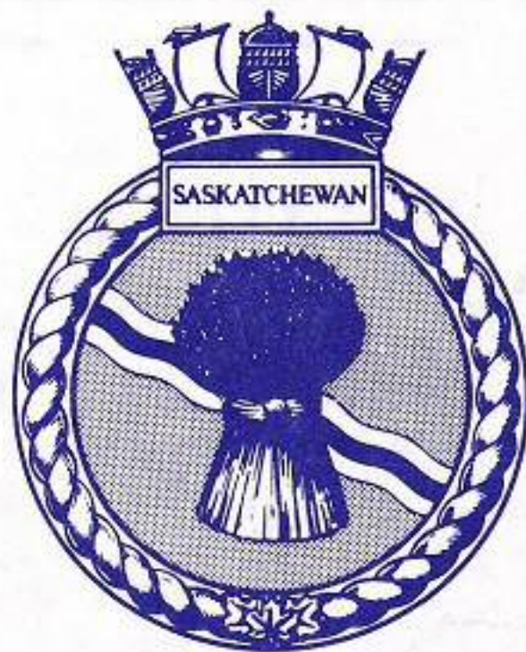
THE SHIP'S BADGE

BLAZON: Vert, a bend wavy Argent charged with a like bendlet Gules, and over all Garb, Or.