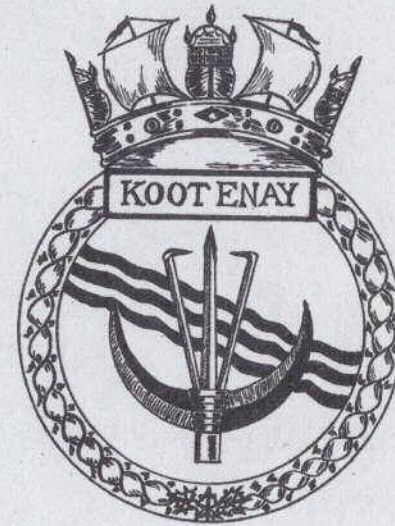
THE SHIP'S BADGE