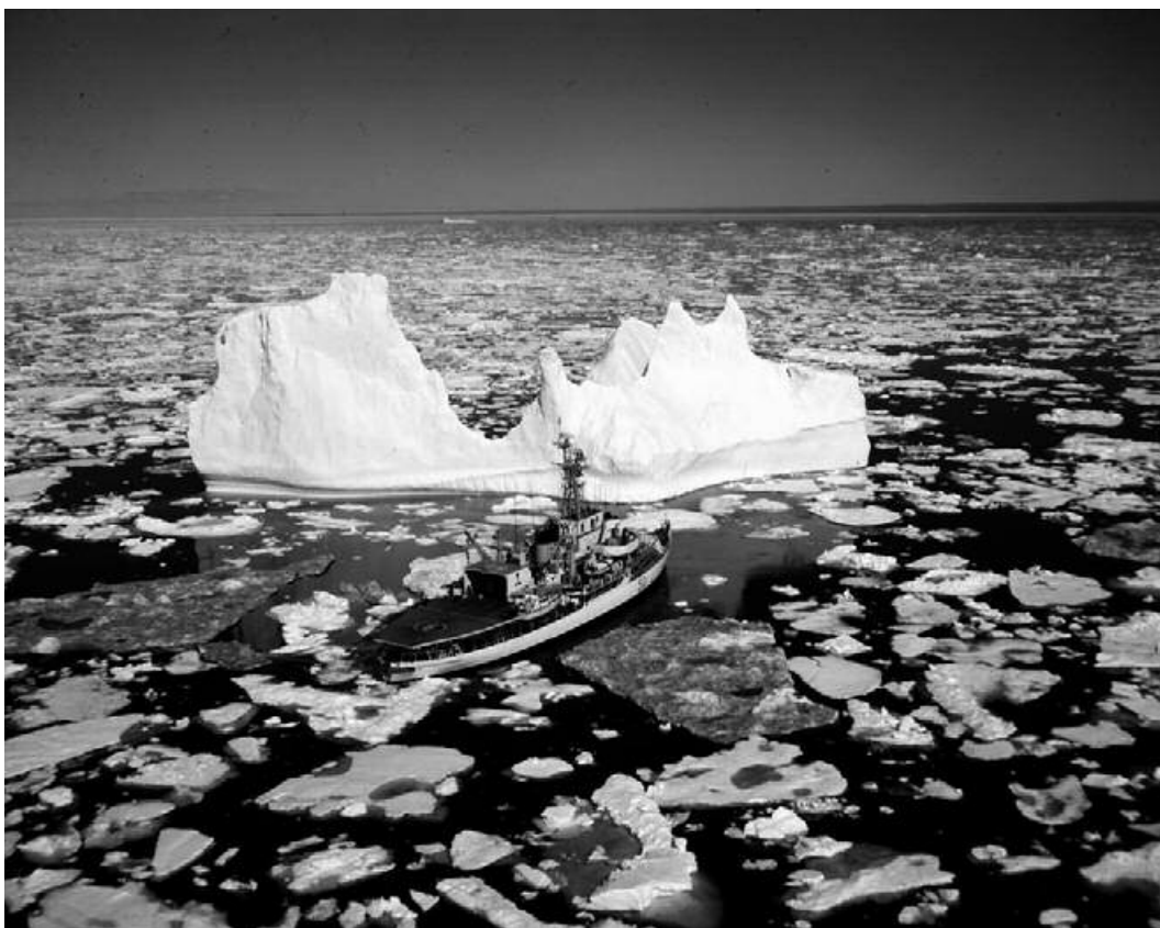
HMCS Labrador alongside iceberg

growing and became known to many outside his small circle of Arctic veterans. In April 1952, he was asked to present the naval aspects of Arctic combat at the United Services Institute conference in Montreal. 31 Then, in August 1953, he was brought to headquarters in Ottawa as the staff officer (Arctic) as the RCN began to prepare for a more concentrated venture into Arctic operations. His work included coordinating the maiden voyage of the navy’s new icebreaker, HMCS Labrador , nearing completion at the shipyard in Sorel. 32