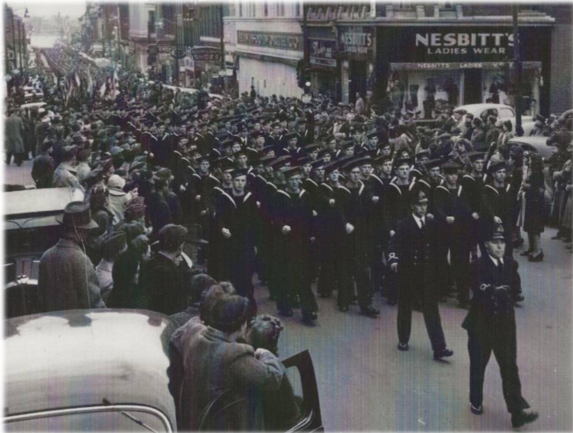
UNTD on Victory Loans Parade Marching up Princess Street 1945

They wore the uniform of a rating with a white band in place of a cap tally which was later replaced by the war-time cap tally with HMCS embroidered on it.