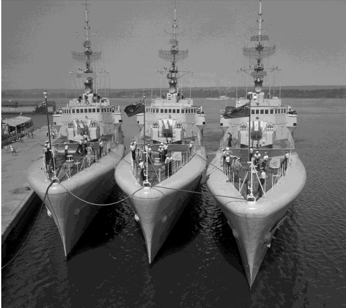
Alongside in Hamilton, HMC Ships St. Croix , Kootenay , and Terra Nova