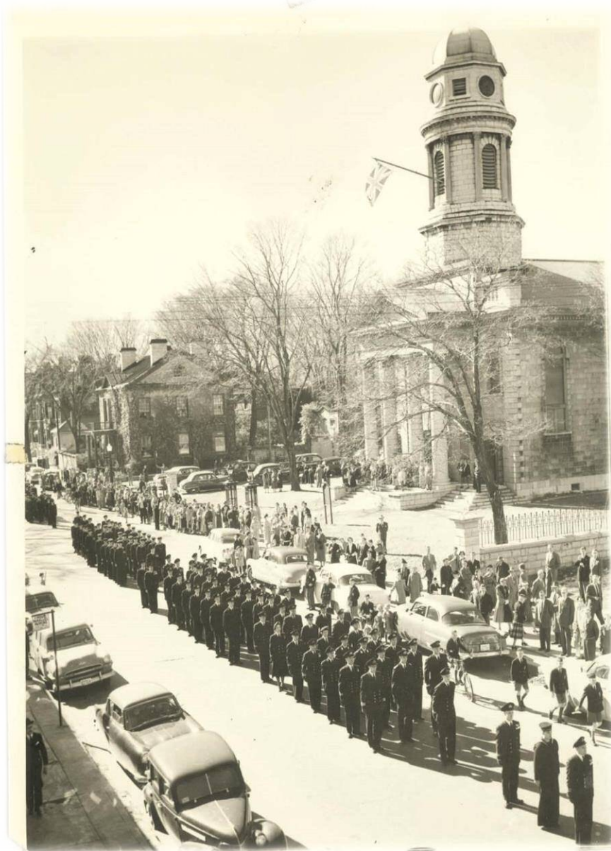
Trafalgar Day Parade in Front of St. George's Cathedral October 1955

On 23 October 1955 HMCS Cataraqui held a special parade in honour of the 150 th Anniversary of Horatio Nelson, 1 st Viscount's victory over the French at Trafalgar. In October 1955 the Annual Trafalgar Day Ball was held in honour of the 150 th Anniversary of Lord Nelson's victory at Trafalgar.