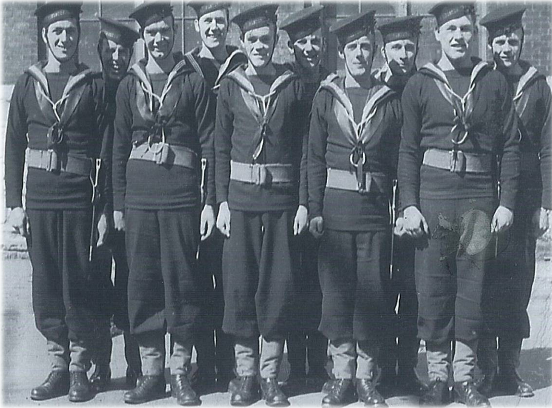
Original Members of RCNVR Kingston