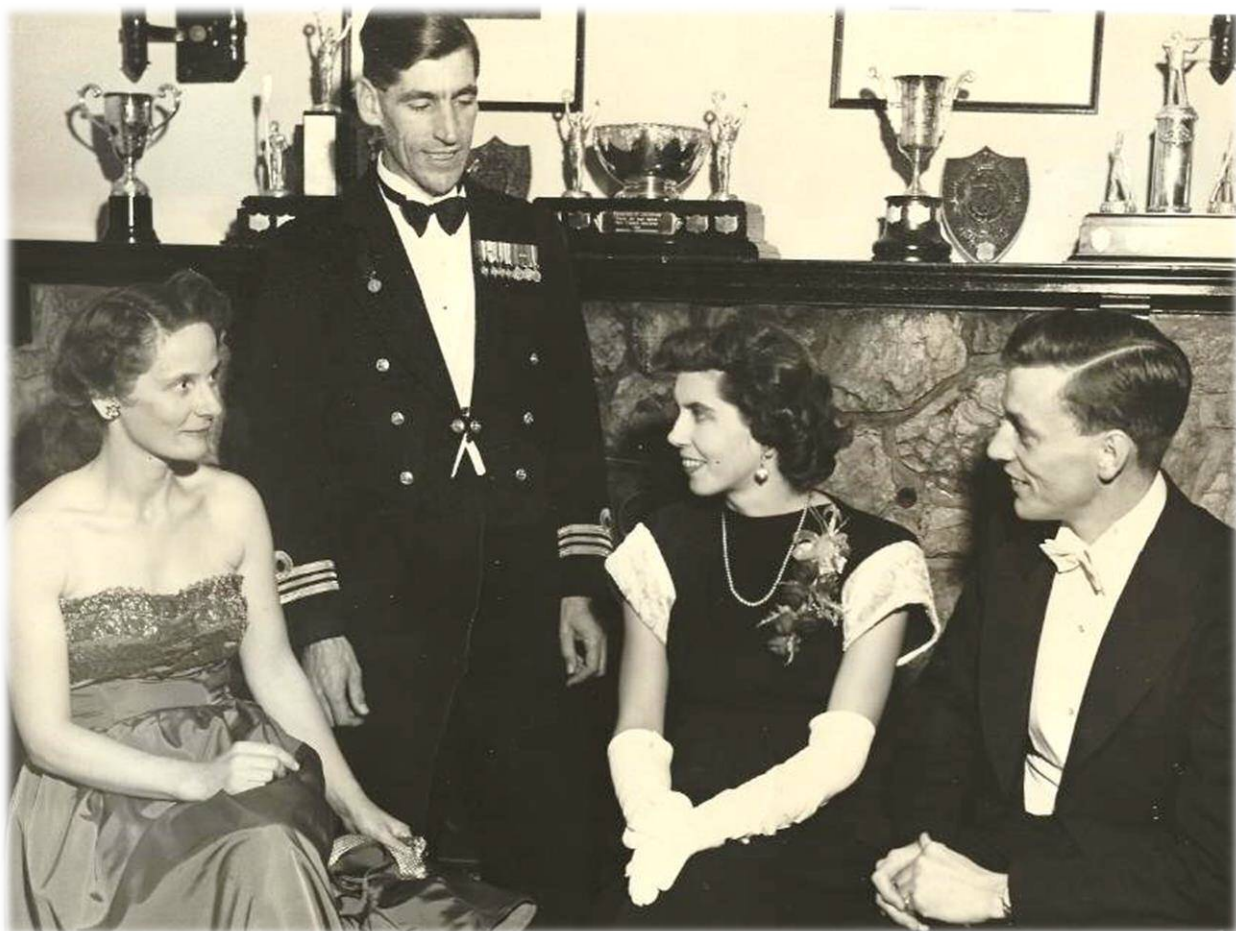
Trafalgar Ball 24 October 1952