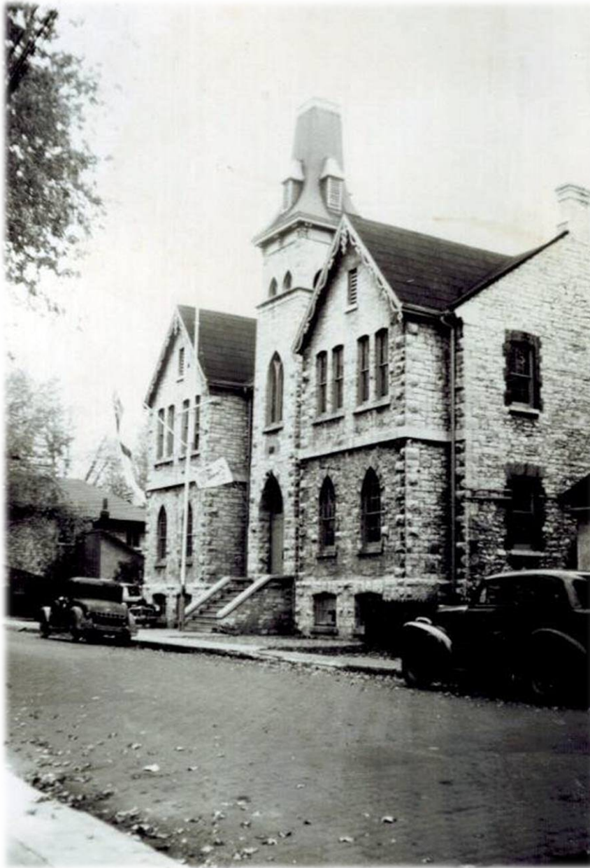
47 Wellington Street

The new quarters accommodated a total of 125 men for sleeping, messing, and training. The officers were billeted in private residence for which they received lounge and scrouge (lodging and compensation).