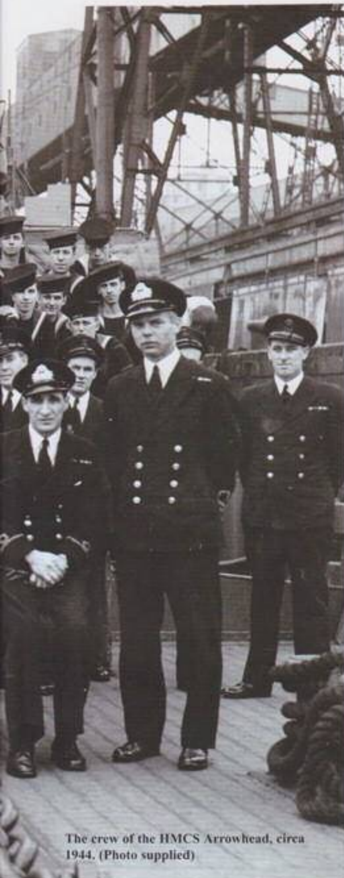
The crew of the HMCS Arrowhead, circa 1944.