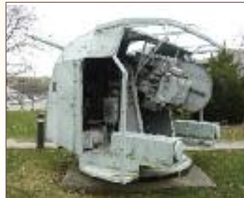
Twin 4-inch gun mount

The RMC Campus also has a 21-inch torpedo and a twin 4-inch gun mount , which were acquired during the College's 100th anniversary in 1976. The torpedo is of the type used by the Royal Canadian Navy (RCN) in WW II. The 4-inch gun mount was originally fitted in the destroyer HMCS Huron during WW II and then, in 1952, in HMCS Donnacona , the Naval Reserve Division (NRD) in Montréal, Québec. It was used at the NRD for training until it was moved to RMC.