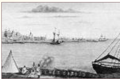
Fort Frederick and naval dockyard circa 1813

Kingston's location at the junction of the Rideau Canal, the St. Lawrence River and Lake Ontario made it the primary military and economic centre of Upper Canada. Kingston served as the capital of the united provinces of Canada from 1841 until 1844 when the capital was moved to Montréal.