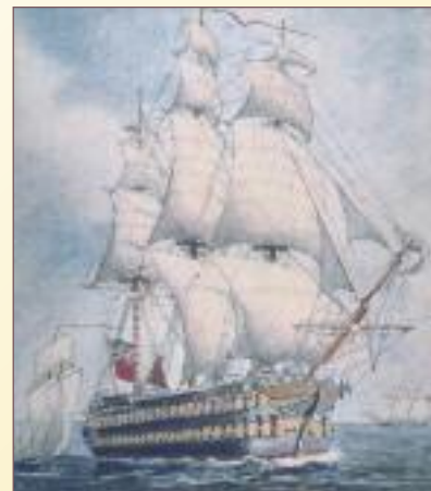
HMS St. Lawrence

4 The Stone Frigate is a stone building that was erected in the Dockyard as a warehouse for naval stores. Although planned in 1816, it was not completed until 1820 when the need for storage facilities to