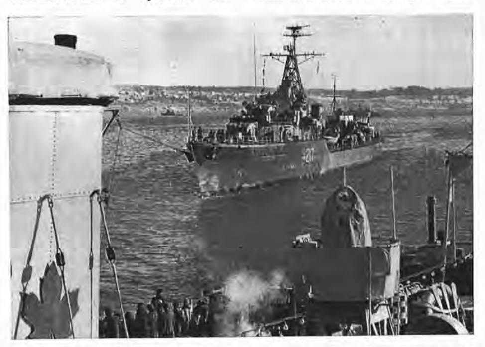
It was a raw, cold morning when HMCS Iroquois returned to her Halifax home from the Korean theatre, but there was no mistaking the warmth of the greeting given the ship's company by relatives and friends who had turned out to meet them. The Iroquois, first Canadian warship to suffer battle casualties in the war, arrived at Halifax January 8. (HS-23490).

The Haida continued to pound train and track for nearly an hour.