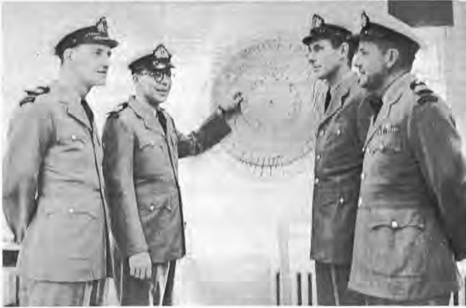
Giant models of slide rules and calculators help naval officers solve typical nuclear problems at Camp Borden. (O-12581)

In addition to these standard courses, many special courses are "tailored" on request to meet the special needs of any one service. Typical one-service courses have been those provided for RCN(R) officers, for the Army's National Survival staff, for the RCAF's Nuclear Defence branch, and for the RCMP. Two RCN(R) courses are planned again this summer.