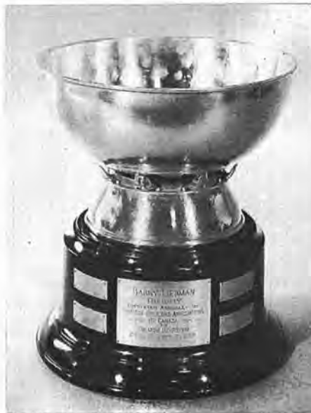
The Naval Officers' Associations of Canada have presented a cup, known as the Barry German Trophy, for annual award to the naval division showing the most improvement during the year. (COND-5713)

It has been hailed as a new means by which to test new ideas without danger to man, machine or equipment can go so far as to create the actual noise of a plane taking off, even to the effect of the front wheel bouncing on the runway. It can also create the effect of a crash landing.