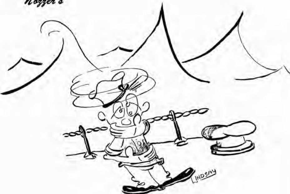
... First meal