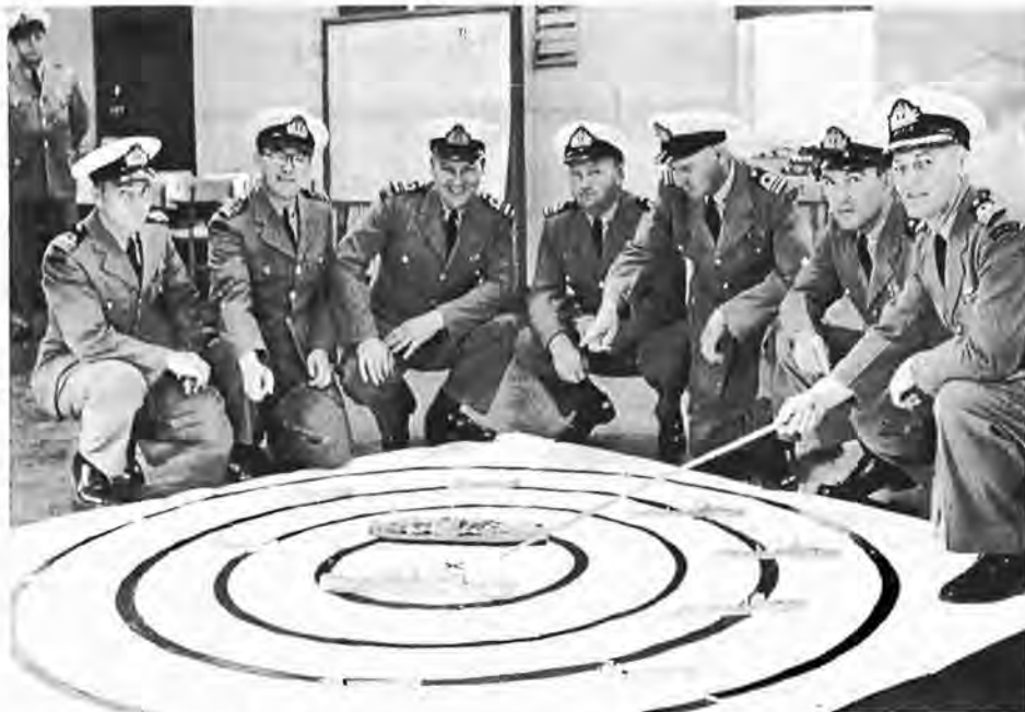
RCN(R) officers at Camp Borden's Joint Nuclear, Biological and Chemical Defensive Warfare School study the theoretical effects on ship formations of nuclear weapons at sea. (O-12579)