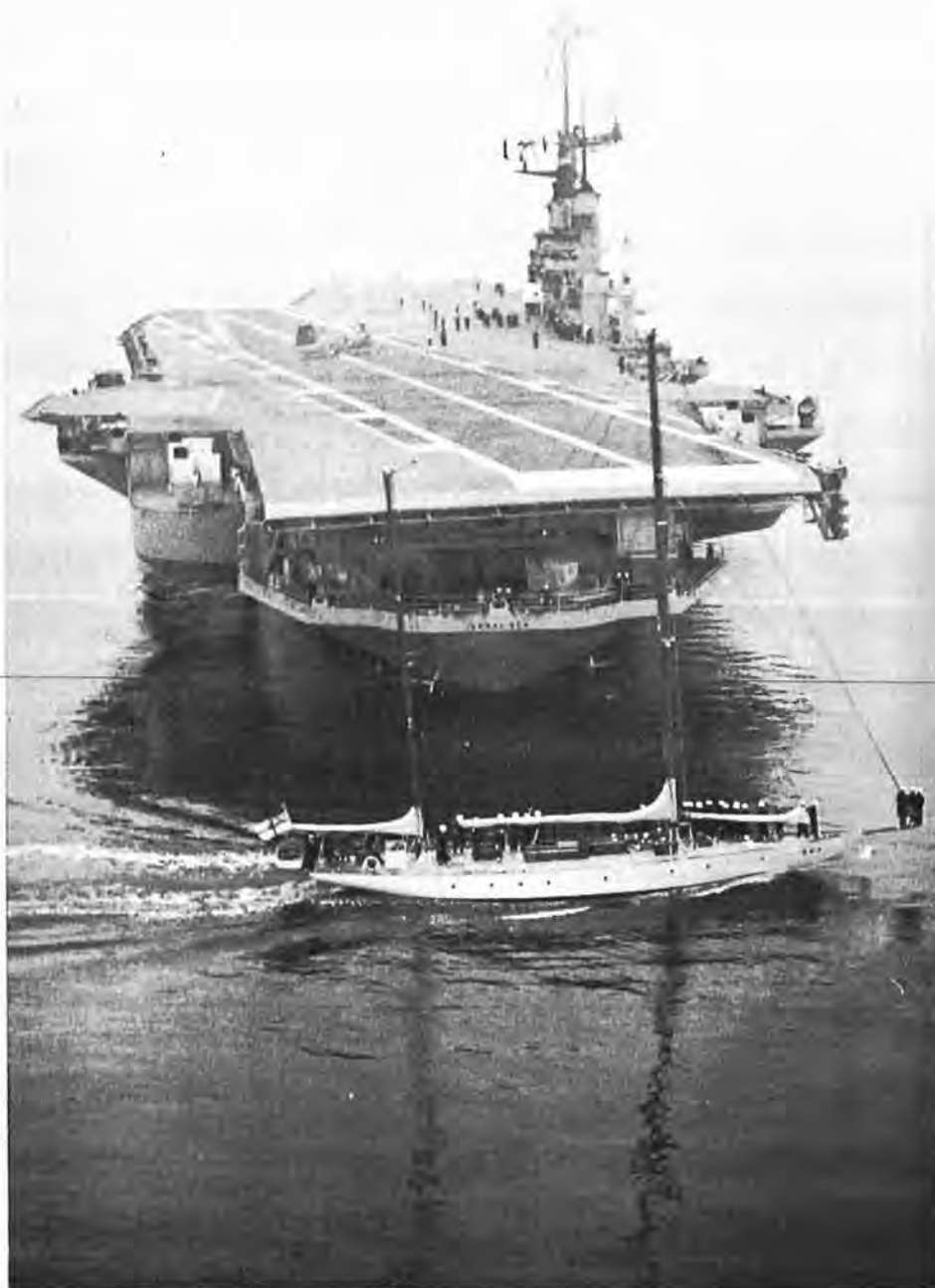
The mighty aircraft carrier USS Coral Sea left British Columbia March 21 after spending a week-end in Vancouver. At the mainland city the 63,000-ton floating airfield was given a tumultuous welcome by crowds measured in thousands. While she was off Victoria a group of Venture cadets, many of whom are destined for naval aviation, were able to get a close look at the great ship from their own training yacht, the Oriole.